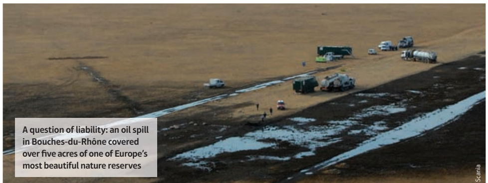
A question of liability: an oil spill in Bouches-du-Rhône covered over five acres of one of Europe's most beautiful nature reserves

The pipeline, operated by the South European Pipeline Company, reportedly carried 23 million metric tonnes of crude oil per year to refineries and petrochemical plants in France, Germany and Switzerland. The clean-up costs were